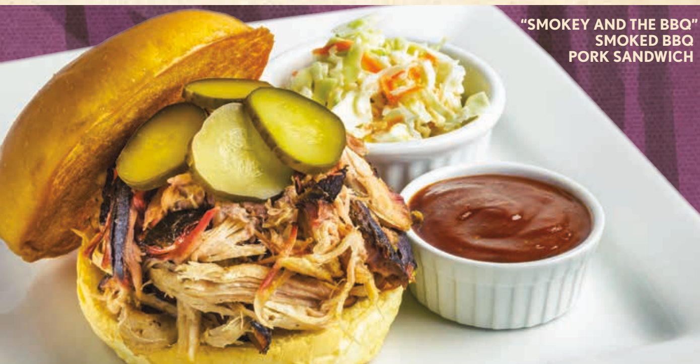
"SMOKEY AND THE BBQ" SMOKED BBQ PORK SANDWICH

A fresh-cut cauliflower steak, seasoned and grilled to perfection with lemon, capers, and olive oil. Topped with sun-dried tomatoes and fresh basil. Served with fresh kale and brussels sprouts, pan-roasted until lightly brown then tossed with Craisins and raspberry vinaigrette. 12