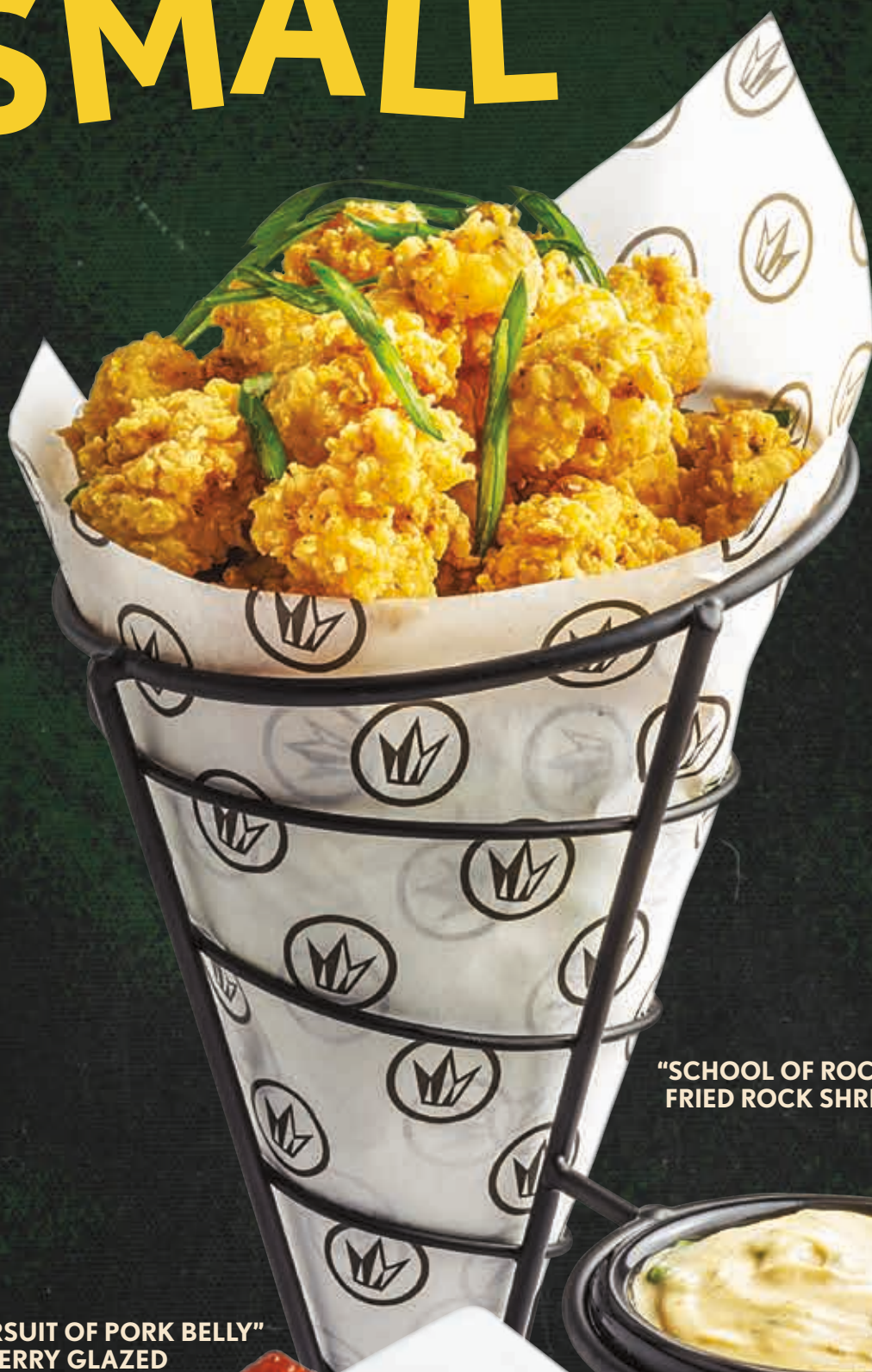
"SCHOOL OF ROCK SHRIMP" FRIED ROCK SHRIMP