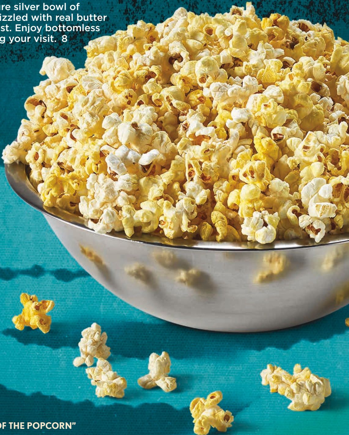
"CHILDREN OF THE POPCORN" POPCORN

Our signature silver bowl of popcorn drizzled with real butter upon request. Enjoy bottomless refills during your visit. 8