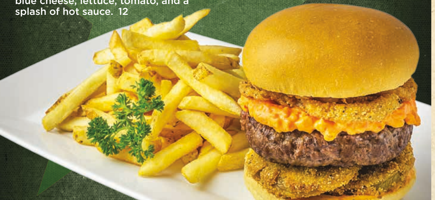
"TO KILL A MOCKINGBURGER" DEEP SOUTH BURGER

6 oz. fresh Black Angus beef patty, hand-pressed and topped with pimento cheese, fried green tomatoes, tobacco onions, and roasted red pepper mayo. 13