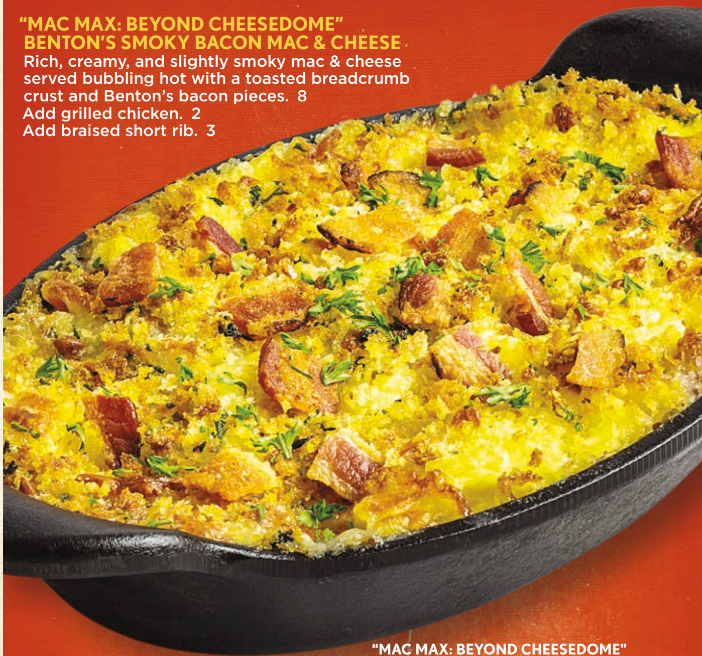
"MAC MAX: BEYOND CHEESEDOME" BENTON'S SMOKY BACON MAC & CHEESE

Smoked end pieces of baby back ribs tossed in sweet Asian garlic and ginger hoisin BBQ sauce. 12