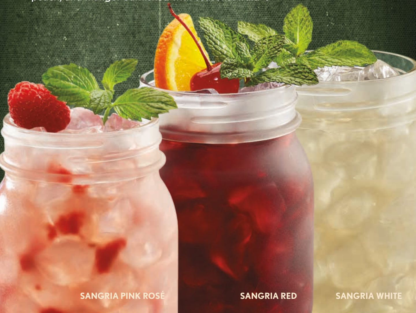
SANGRIA PINK ROSÉ

100% all natural and gluten-free. Spanish Airén grapes blended with lemon, peach, and mango. Garnished with seasonal fruit. 8