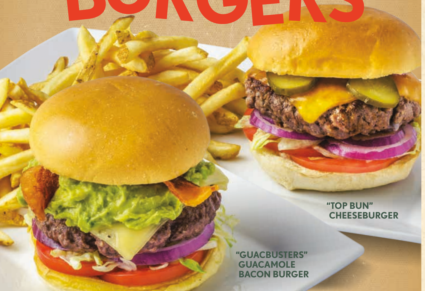
"TOP BUN" CHEESEBURGER