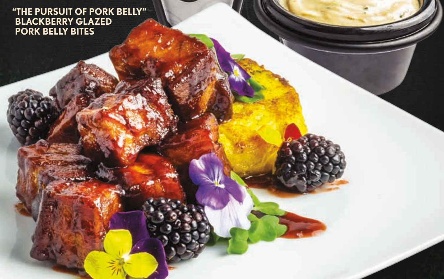
"THE PURSUIT OF PORK BELLY" BLACKBERRY GLAZED PORK BELLY BITES