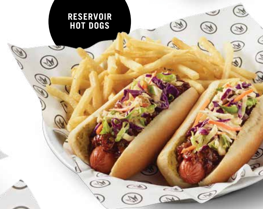
RESERVOIR HOT DOGS