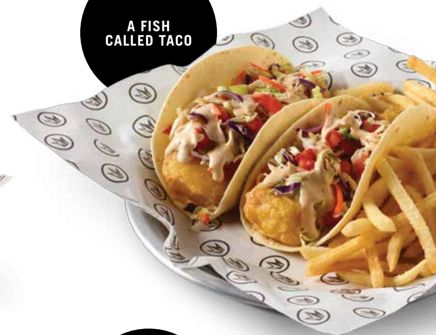
A FISH CALLED TACO