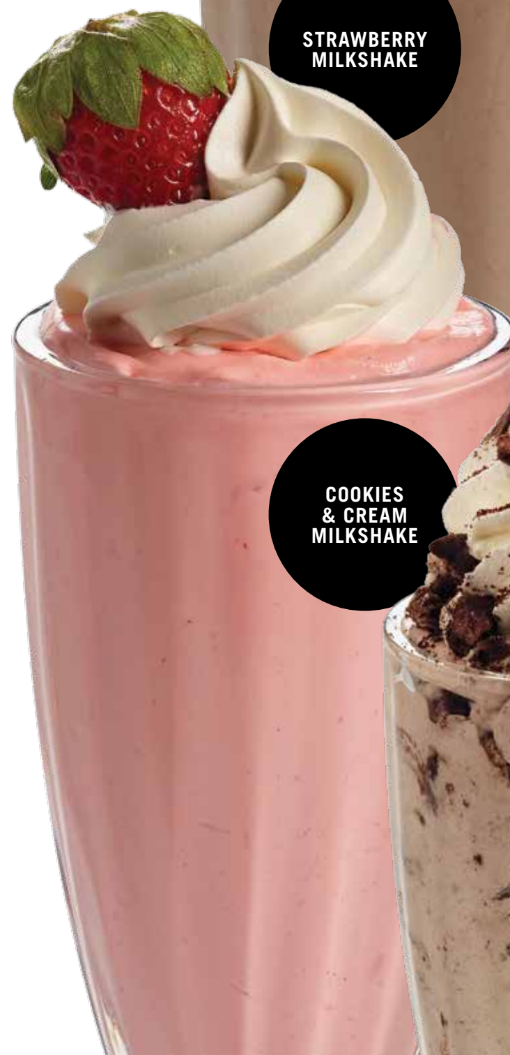
COOKIES & CREAM MILKSHAKE