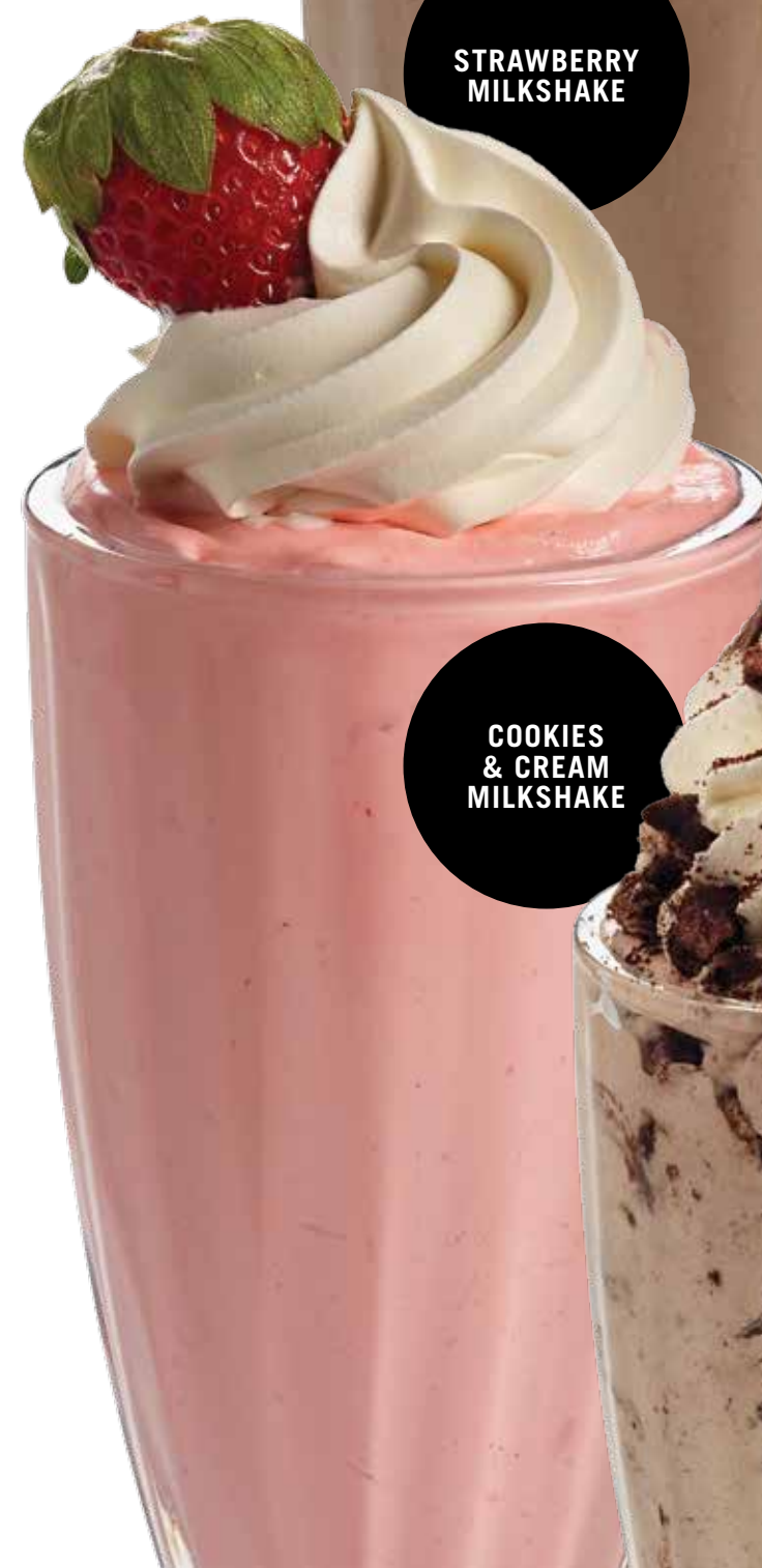
COOKIES & CREAM MILKSHAKE